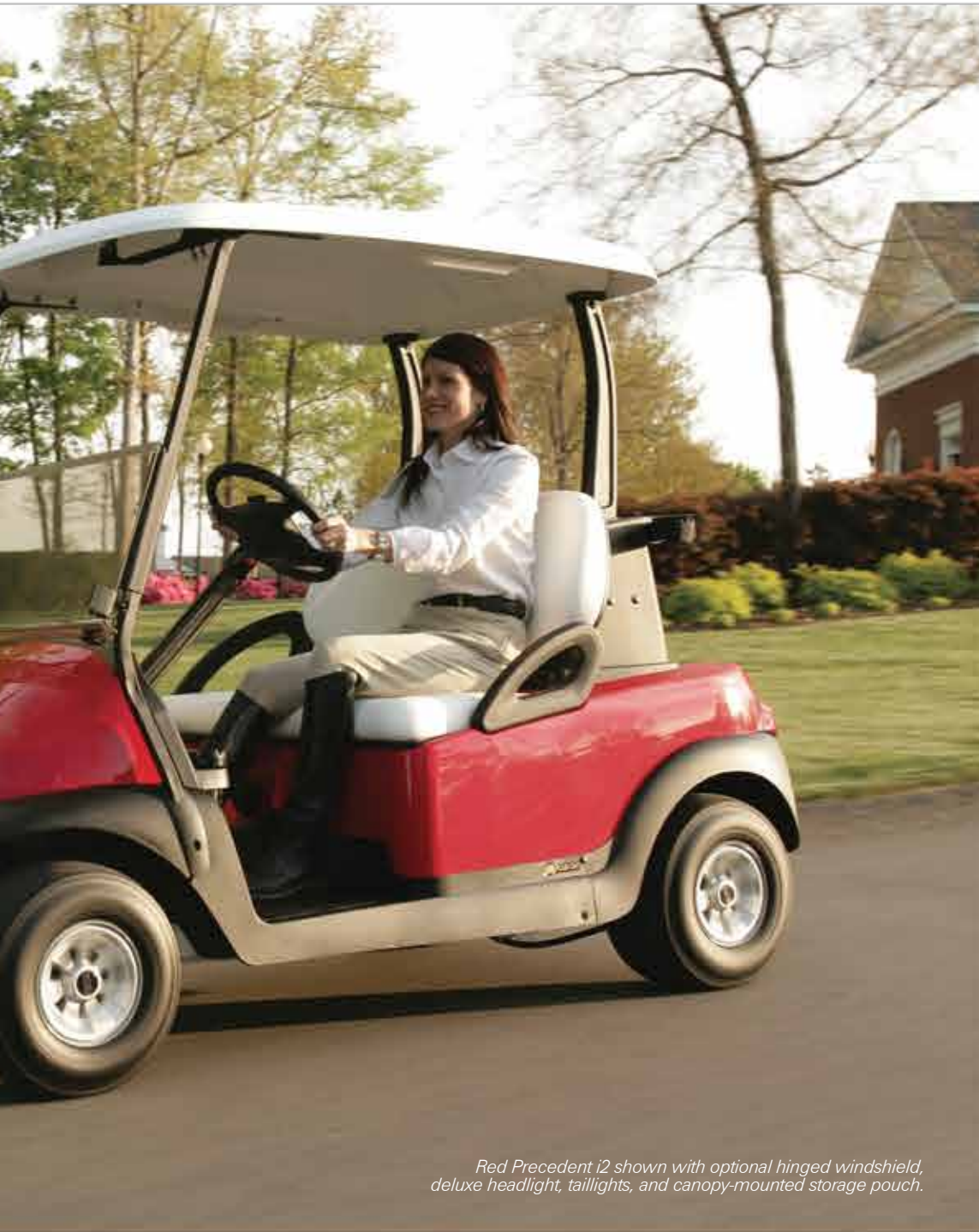
Red Precedent i2 shown with optional hinged windshield, deluxe headlight, taillights, and canopy-mounted storage pouch.