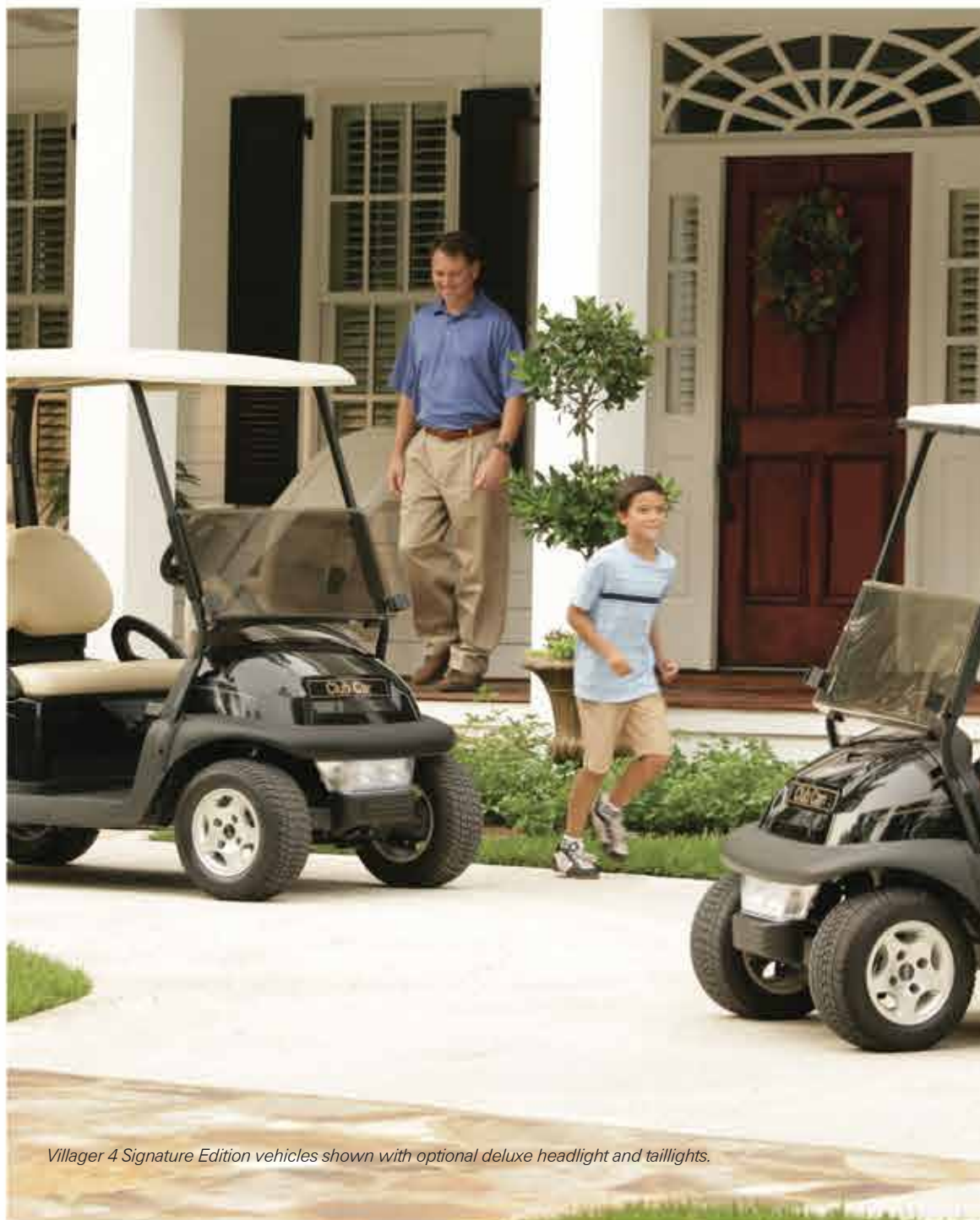
Villager 4 Signature Edition vehicles shown with optional deluxe headlight and taillights.

Above: Beige Villager 4 with optional hinged windshield, deluxe headlight, and 5-panel mirror.