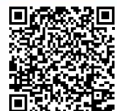
Dealer Locator Quick Code

Ingersoll Rand is a global diversified firm providing products, services and solutions to enhance the quality and comfort of air in homes and buildings, transport and protect food and perishables, secure homes and commercial properties, and increase industrial productivity and efficiency. Driven by a 100-year-old tradition of technological innovation, we enable our customers to create progress and a positive impact in their world.