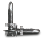
Self Tapping Screws

Madjax® recommends professional installation. If you choose to not have this product installed by a professional, we highly recommend that you exercise caution, care, and patience when installing this product as it involves drilling holes into your cart's struts.