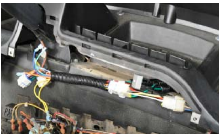
1. (Replaces Step 4 in Light Kit Instructions) Use the Sub Harness as an adapter between the 12 pin Precedent and the 9-pin main harness behind vehicle dash.